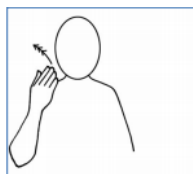
Once upon a time